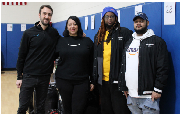
Employees from our lead sponsor, Amazon, volunteered at Adopt-a-Family.