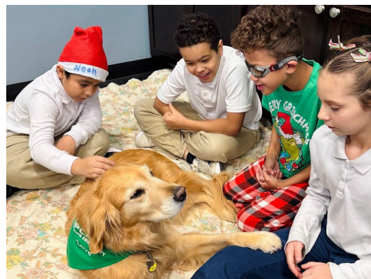
Falk-Roosevelt students welcomed a furry friend to their classroom.