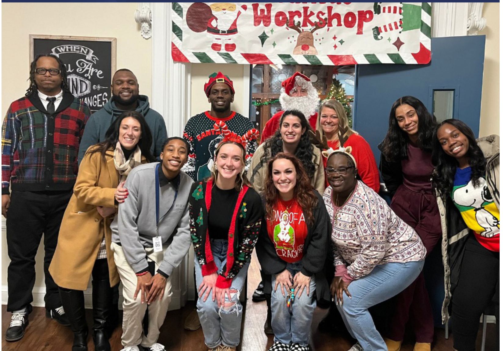
The Residential Treatment team was full of smiles this holiday season.