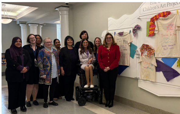
Artwork created through the Haven House Art Empowerment Program was unveiled at Erie County Family Court.