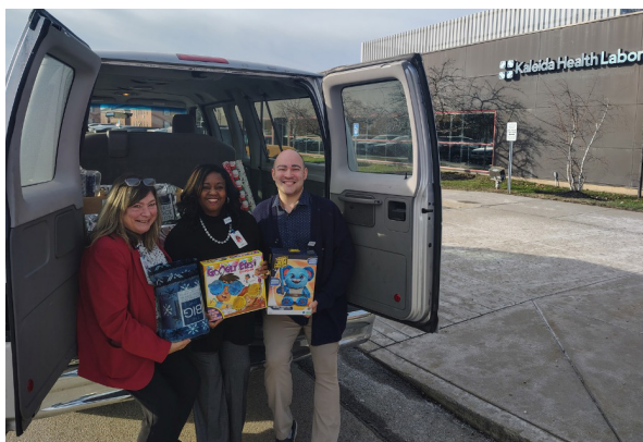
Kaleida Health Laboratories participated in Haven House's largest donation drive, Toyland.