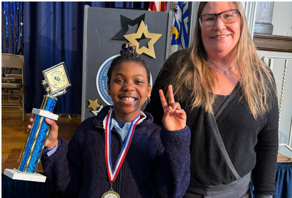
The Stanley G. Falk School held their eighth annual spelling bee competition.