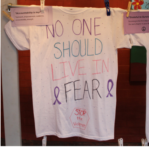
Artwork created by a survivor in honor of Domestic Violence Awareness Month.