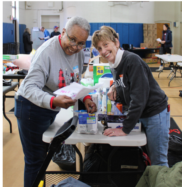
Adopt-a-Family volunteers organizing donations for families.

The impact reached far beyond the items themselves. The family shared their deep gratitude for the care and generosity they received, which is a powerful reminder of what's possible when a community comes together to support families during difficult moments.