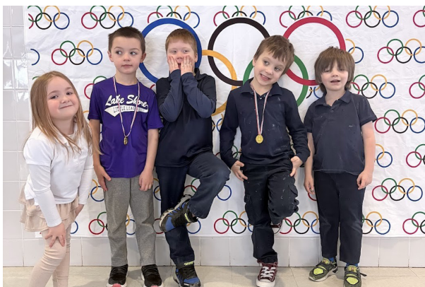
Falk-Mullen students participated in a Winter Olympics Day.