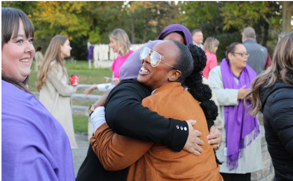
C+FS annual press conference, Shine the Light, was held at the Tribute Garden in Tonawanda on Thursday, October 17.