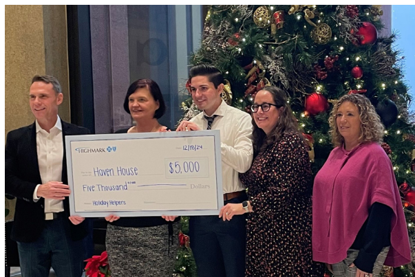
Highmark Blue Cross Blue Shield of WNY selected Haven House to receive $5,000.