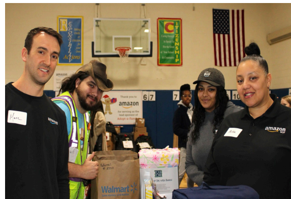
The Amazon team sorting through donations during Adopt-a-Family 2024.