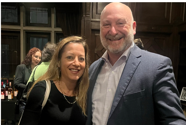
C+FS held a Partner Appreciation event in the Richmond-Lockwood library.