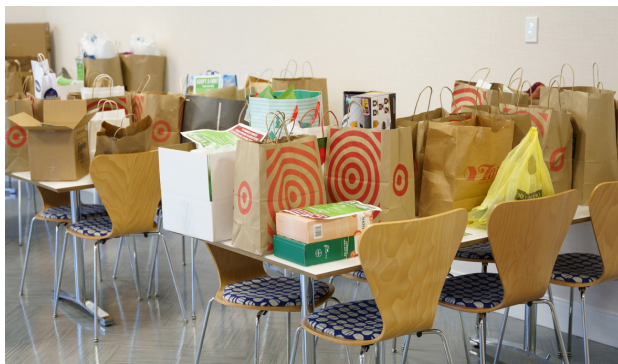
Curbell's Adopt-a-Family gifts.