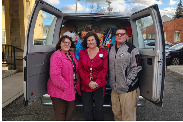
Brookdale-Kenmore filled an entire van with donations including toys, hygiene products and winter clothing.