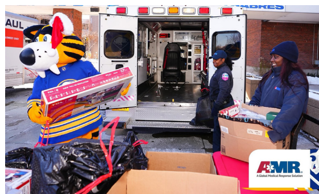
The Buffalo Sabres Holiday Angels Program.