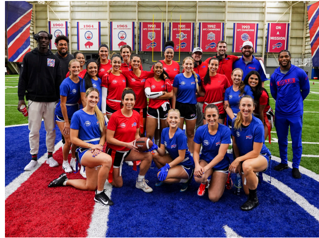
Buffalo Bills WAGS with their team captains raise money for Haven House.